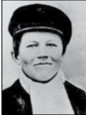
Thomas Edison as a boy.

Thomas Alva Edison (February 11, 1847 – October 18, 1931) was an American inventor and scientist. Early in his life, he was a telegraph operator. Edison invented the phonograph, the motion-picture camera, and the electric light bulb. In fact, Edison held 1,093 patents in the United States, as well as in other countries. He contributed greatly to telecommunications. He also developed a battery for an electric car, electrical power, recorded music, and motion pictures. Edison came up with electric power to homes, businesses, and factories, making him a true pioneer of industry.